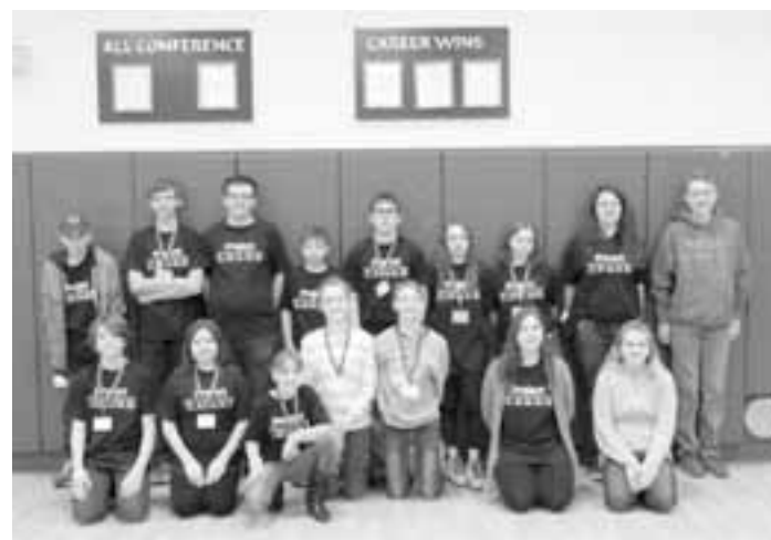
Students from Hesperia who participated in the STEAM Challenge