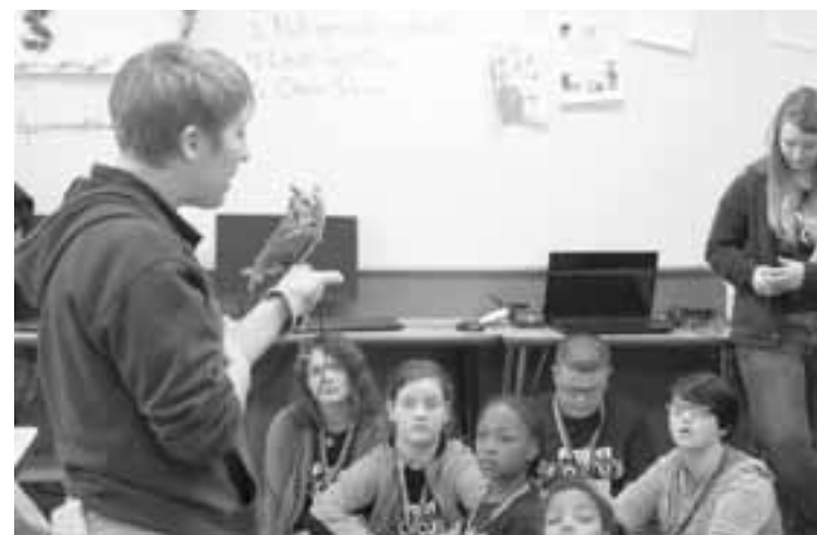
John Ball Zoo showcasing some of their traveling exhibits