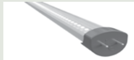
Photo of the LED lights