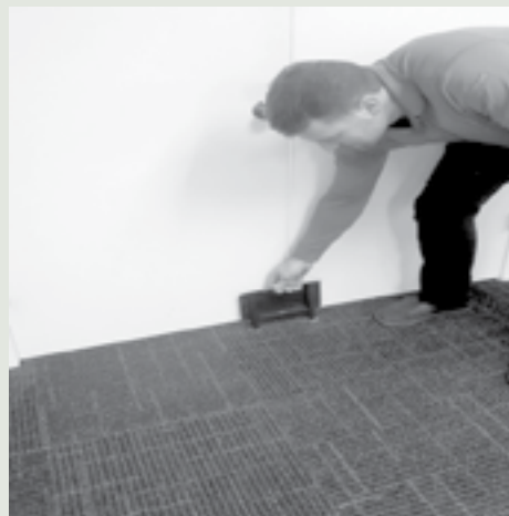
Photo of the Boot