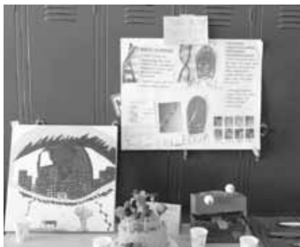
Just a small portion of the art that was brought to the competition