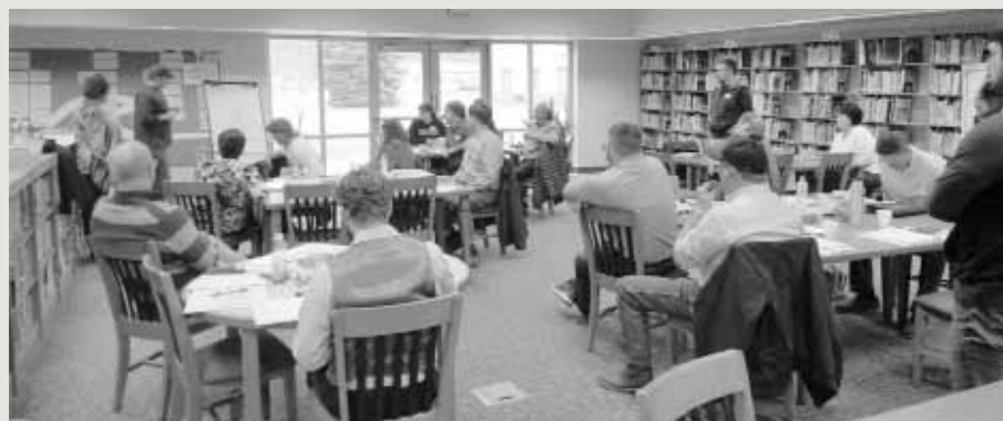
March 25 th Strategic Planning Day

I truly appreciate the dedication, commitment, and time of these volunteers as we move this plan forward for the next three to five years.