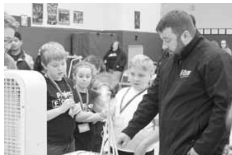
Students test their wind-powered turbines for output voltage

Students had the goal of visiting all exhibits during this busy time, and students who attended enough events were entered into a raffle for some really great prizes. Top prizes included a camera ready drone, and some engineering based science kits. Each school brought home medals, and the event was a huge success! We look forward to a bigger and better STEAM Competition for 2018!